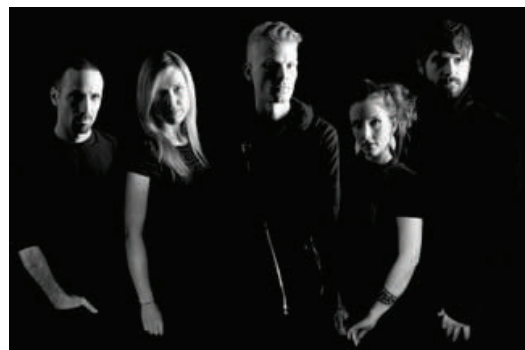
Mother Mother - Vancouver's own pride and glory.