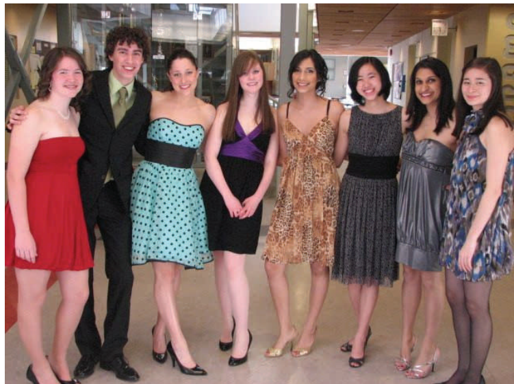
Grads strutting their stuff before the Boat Cruise.

“As I’m sure the boys noticed, the girls at Boat Cruise not only grew a couple inches overnight, but miraculously sported slimmer legs, cuter butts, and a slight limp.”