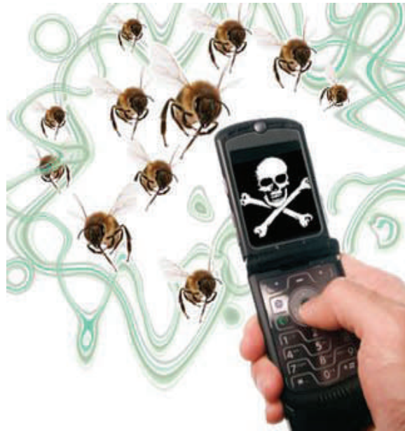
Is your cell phone killing bees?